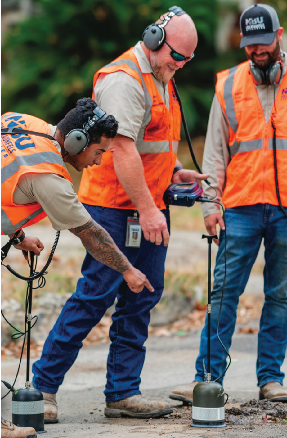
Above: Acoustic leak detection is a cost-effective method of tracing water loss.

2.3 Approve and appropriate funds for additional TWDB water conservation and water planning staff.